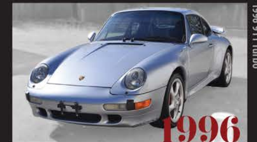
1996 911 Turbo